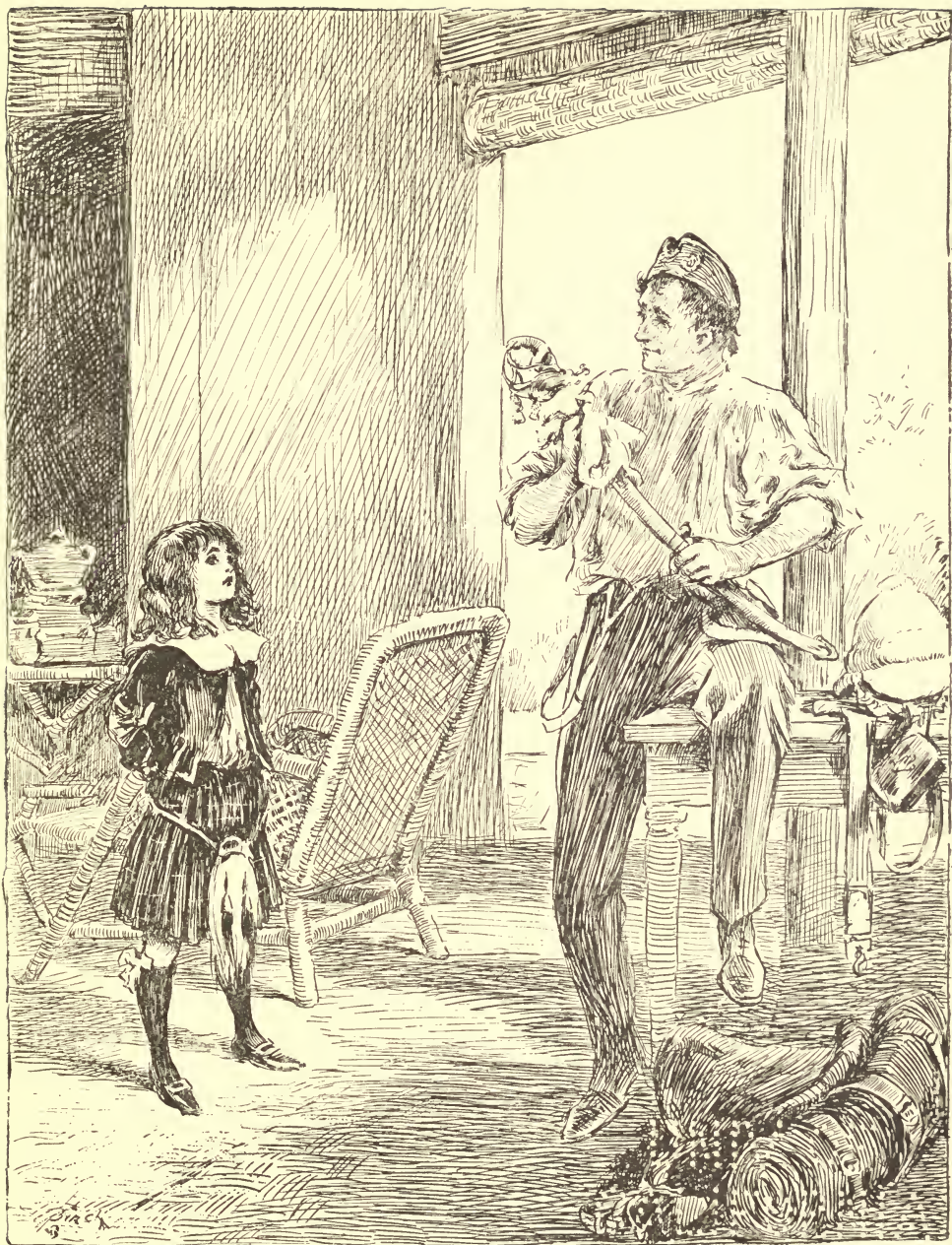
“ I POLISHED AWAY AT THE CAPTAIN’S SABRE ”